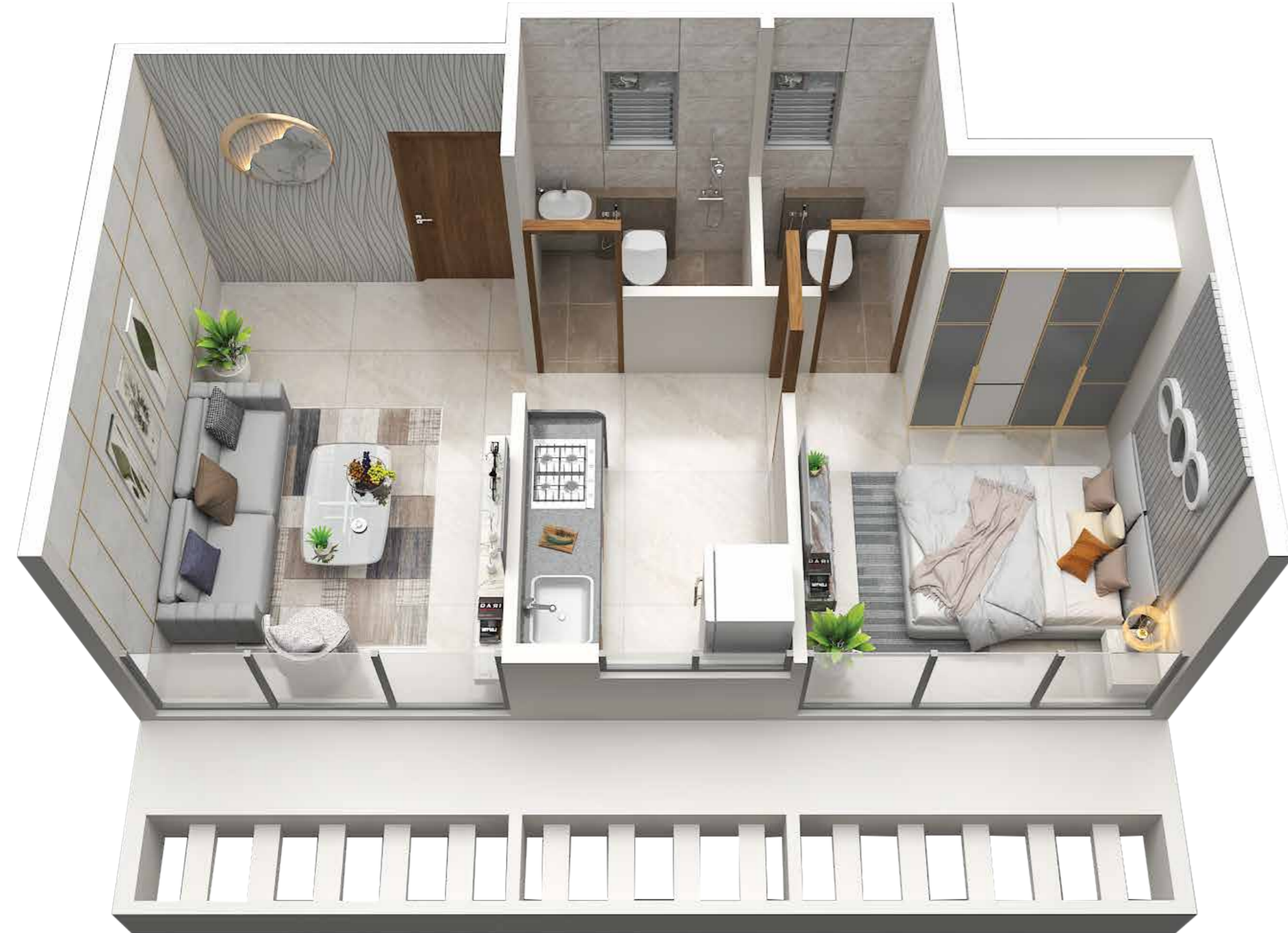
1BHK UNIT PLAN