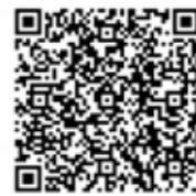
Precious Krishna Hills Location

Plot 24A + 24B, Sector 4, Pushpak Nagar, Dapoli, Navi Mumbai.